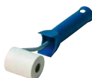
ROLLER page 393