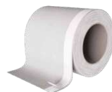
PLASTER BAND LITE page 69