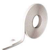
SUPRA BAND page 140